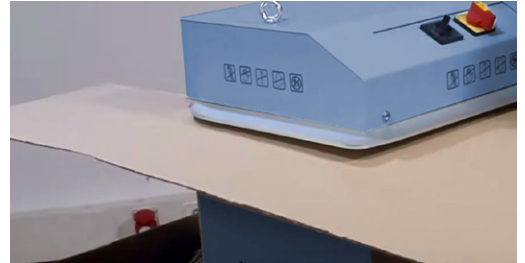
If sheet width exceeds cutting head, excess is trimmed for reuse