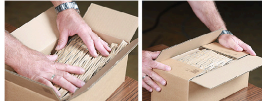
The flexible, netting like filler conforms to any shape item and box